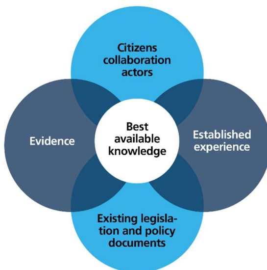
Figure 3. The main sources of knowledge for crime prevention work.

Follow-up and evaluation are important prerequisites for knowledge-based work. The purpose is to collect and feed knowledge back in for continued development.