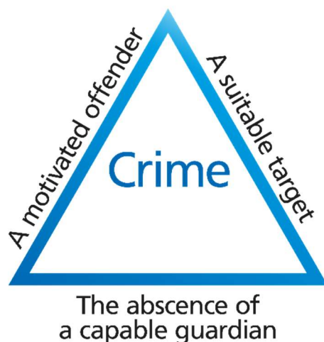
Figure 1. The crime triangle in its basic form.

According to the crime triangle, at least three main prerequisites must be met for an offence to occur: a perpetrator with a desire to commit an offence, a suitable object or victim of the offence, and a lack of formal and informal control, such as a low risk of being detected or weak social ties. Measures should therefore be targeted against one or more of these prerequisites as the probability of offences being committed is reduced if one of the prerequisites is not met. Preventive measures could be, for example, reducing a person's desire to commit an offence, restricting access to or strengthening the protection of suitable objects or victims of crime, or strengthening formal and informal control, i.e. increasing the risk of detection or strengthening other factors that increase formal control.