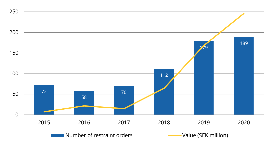
Figure 3 Restraint orders

The FIU is authorised to issue restraint orders for property that is suspected to be subject to money laundering or terrorist financing. The restraint order is a temporary ban on moving or otherwise making use of the property. During 2020, the FIU decided on 189 restraint orders representing a total value of almost a quarter of a billion SEK (see figure 3). This is an increase of 46 per cent compared to 2019 and the highest amount so far.